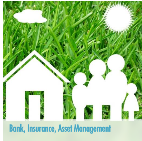
Bank, Insurance, Asset Management

April, Alptis, ADP Group, Cabinet Branchet, CAPRA Assurances, Crédit Agricole, Axeria, Mutuelle Nationale des Hospitaliers, c-monassurance, EOVI-MCD, Véolia-Eolfi Asset Management, Petercam, Groupe Verspieren